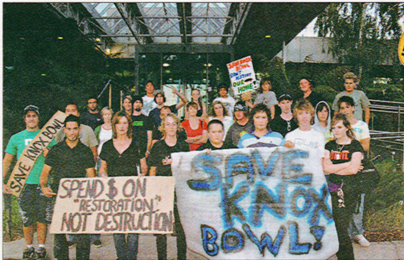
Protesters outside Knox Council offices.